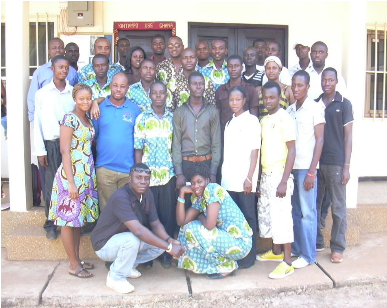
A Cross-section of KHDSS Staff

During the year 2009, data from the KHDSS database was used by individuals and projects from within and outside KHRC. Notable amongst them are graduate students from the School of Public Health, University of Ghana as well as the Kintampo Municipal Assembly for their five-year medium term development plan.